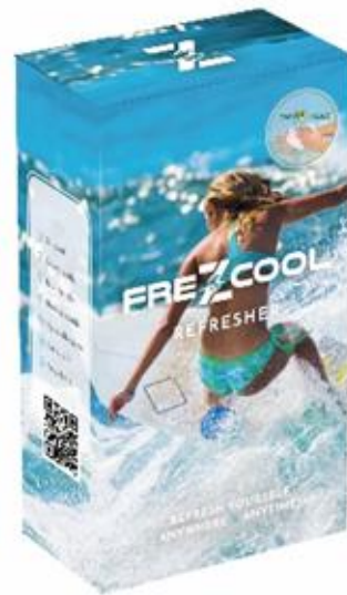
Both the front and the back can be personalised to suit your needs